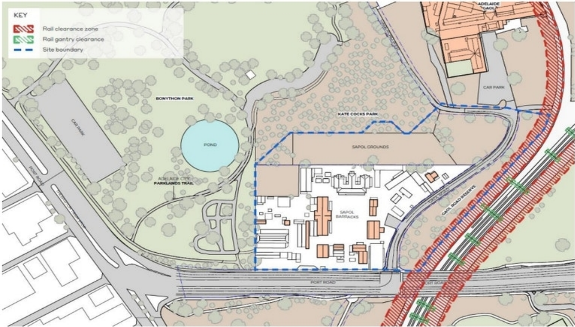
Rail Track Clearances