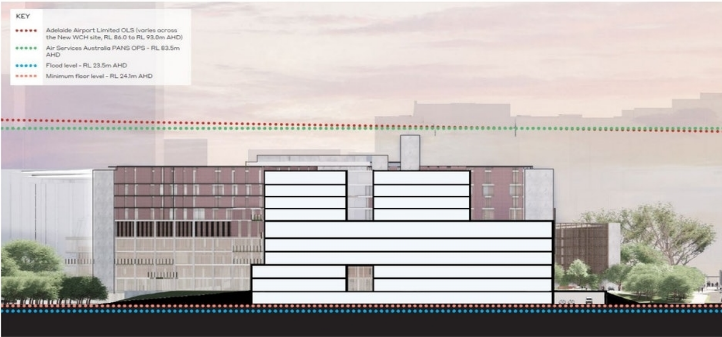
Building Level and Height Limits