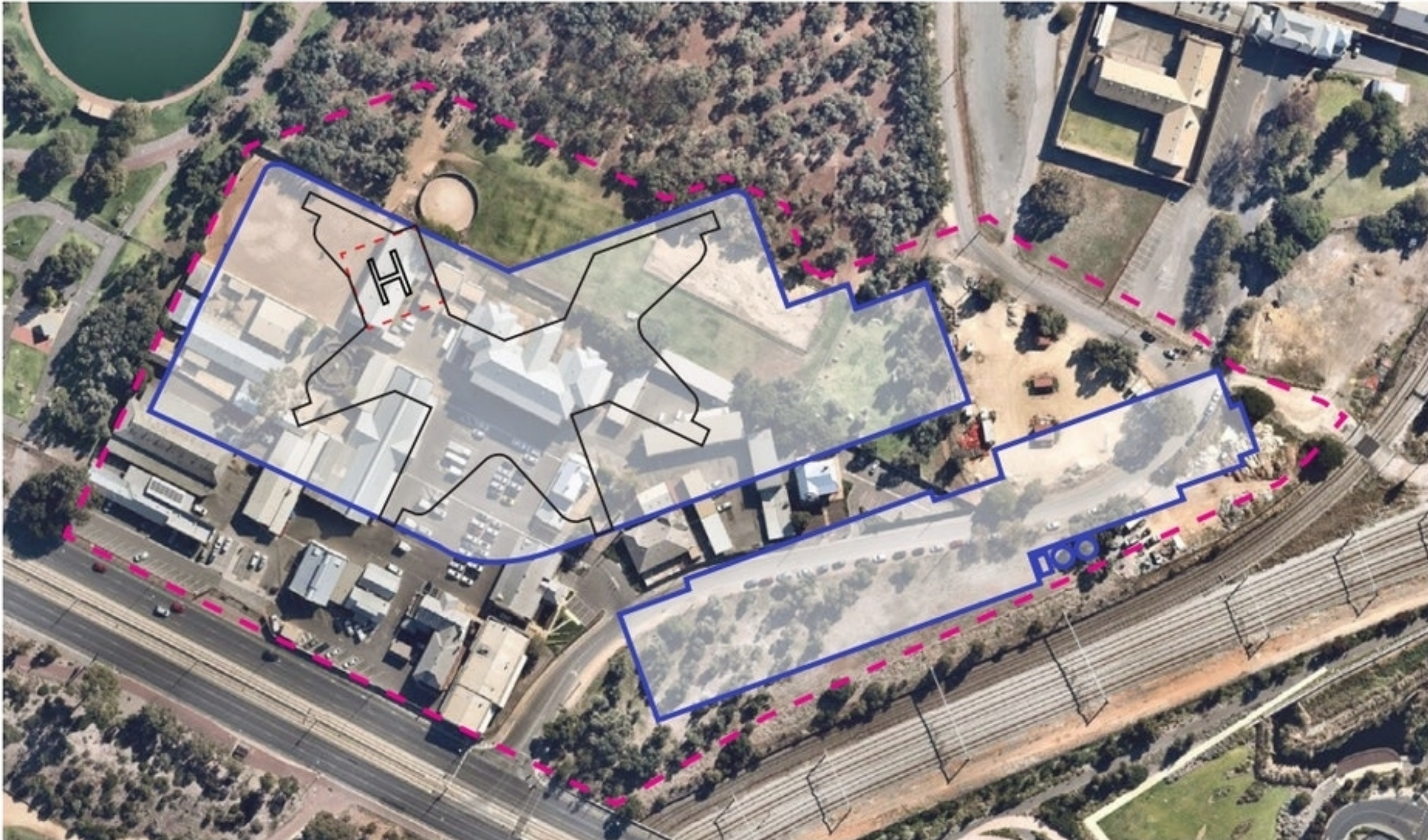
Built Form Overlay - Project Site