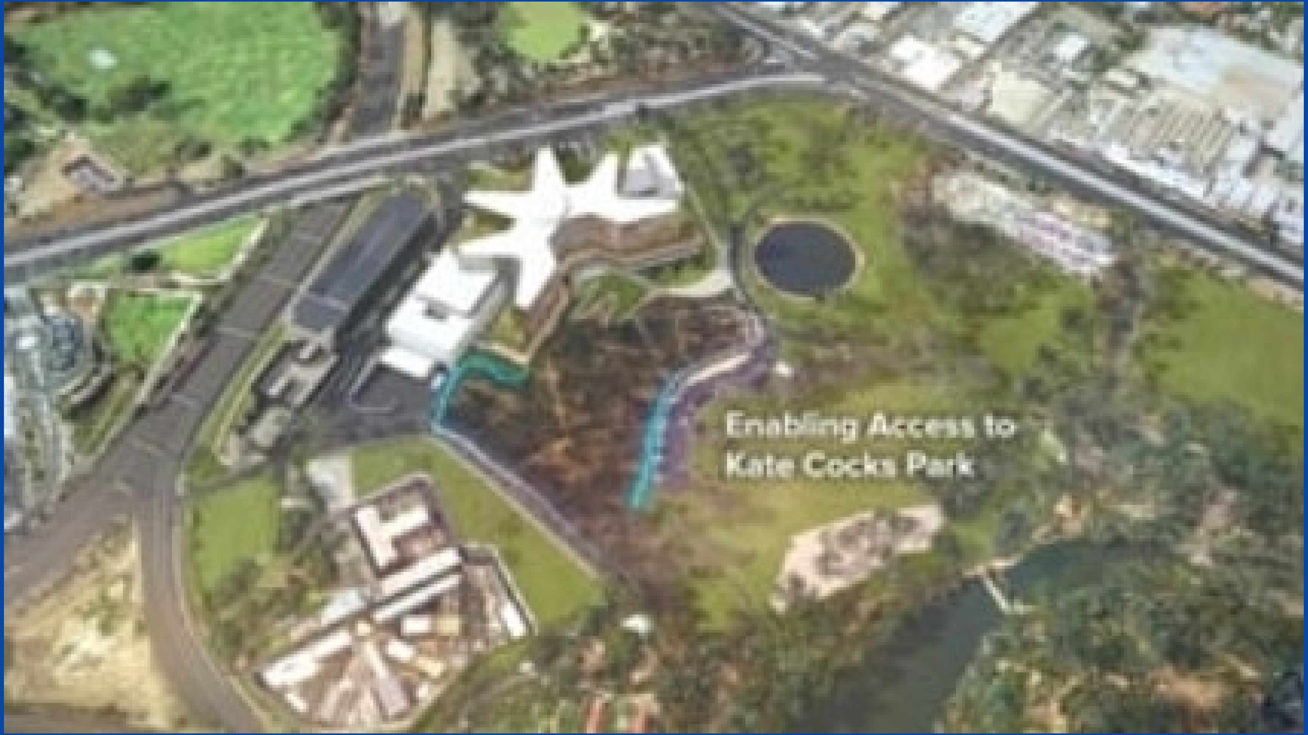
Enabling Access to Kate Cocks Park