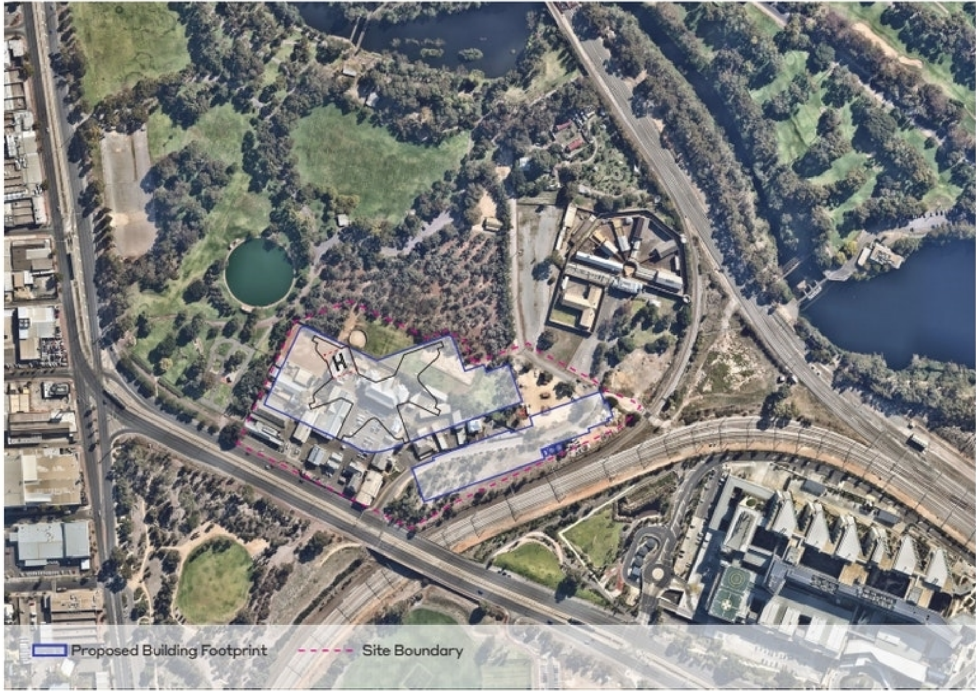
Built Form Overlay - Precinct Setting